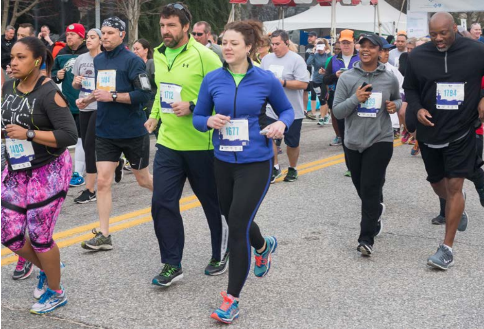
One City Marathon runners take off for the Maritime 8K.

A weekly publication of Newport News Shipbuilding