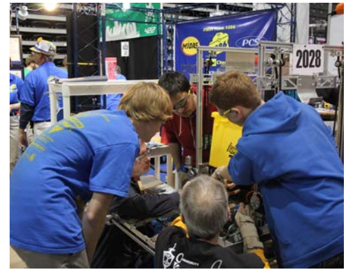
Mentors assist students with solving a problem at the 2015 Robotics Regional Competition.

The event is free and open to the public and will bring 35 of the best High School robotic teams together from across the country. This competition is designed to simulate real world engineering and design challenges by making teams work together to problem solve, design and purchase material quickly and efficiently. The theme this year is a castle tower defense game, where teams of three will compete with robots to cross defenses, shoot boulders and scale the tower to earn points. Visit FIRST Robotics Yardnet website for additional information.