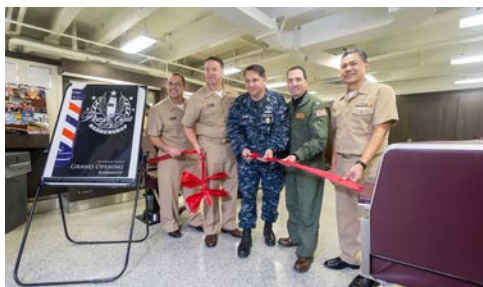
Crew cuts ribbon for barbershop grand opening on board CVN 72.