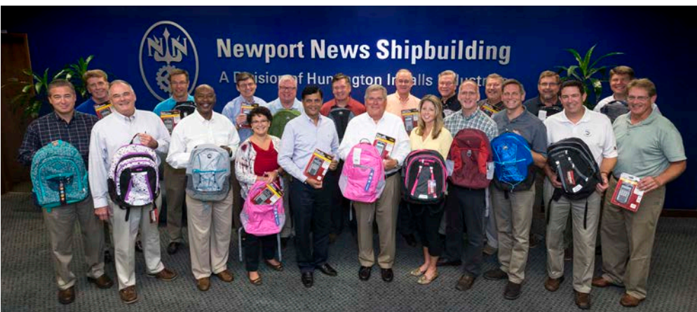
In support of this year’s School Tools Drive, NNS’ senior staff teamed up to purchase 170 backpacks and 80 scientific calculators for local students.

VersAbility has been employing individuals with disabilities in Hampton Roads for more than 60 years. Since 2014, NNS has continued contracting with the agency to produce pipe discs for submarines and aircraft carriers.