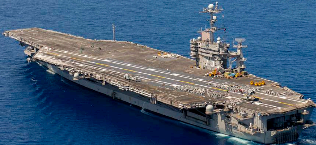
Newport News Shipbuilding received a $52 million contract from the U.S. Navy for work on the aircraft carrier USS Harry S. Truman (CVN 75), shown transiting the Atlantic Ocean in August.