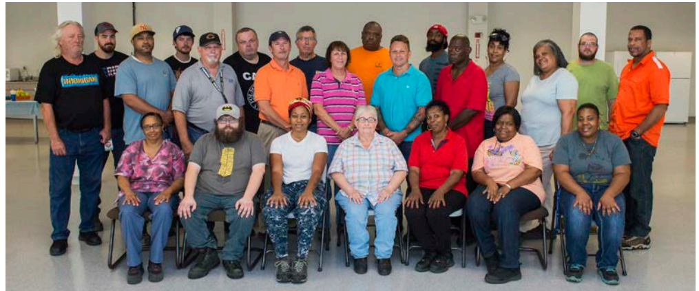
O53's Onboard Repair Parts Team was recognized during a luncheon on Aug. 5.