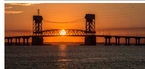
The lift span of the James River Bridge seems to have captured the setting sun.

about how information is found related to training. Feedback will be used to help in the development of a new training information website for employees. The survey is voluntary and consists of five simple questions. Employees are expected to take the survey on their own time with approval from their supervisor. Complete the Survey on MyNNS. For additional questions, visit the Training Feedback website on MyNNS.