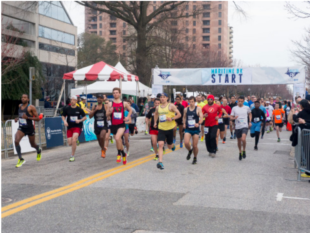
Hundreds of runners take off during the 2016 One City Marathon held on March 13, 2016 in Newport News.

Employees are encouraged to continue to submit ads online at nns.huntingtoningalls.com/currents . As a reminder, all classified ads must be submitted by 4 p.m. each Thursday.