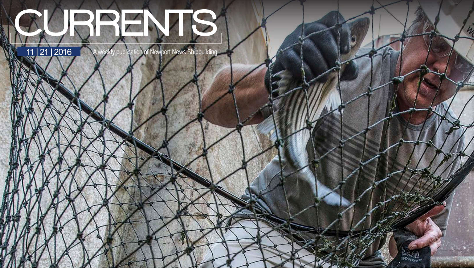
Shipbuilder Thomas Wooten (X36) assists with the fish rescue in Dry Dock 1. Photo by John Whalen