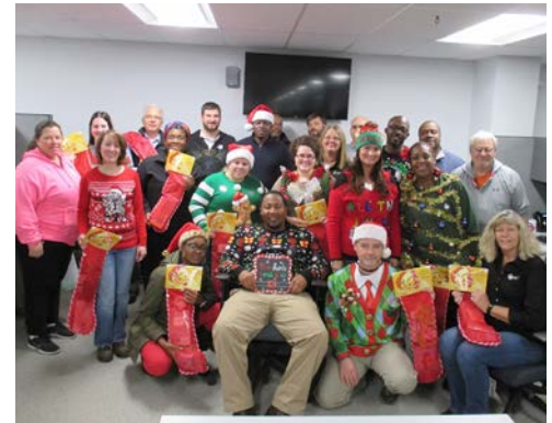
The Dimensional Control (O68) team is pictured with Christmas stockings they stuffed for local children. The group thanked NNS leadership and fellow shipbuilders for supporting the effort.

For more information, search the “Students & New Graduates” portal of the HII Careers website ( www.buildyourcareer.com ) for Job 20453BR.