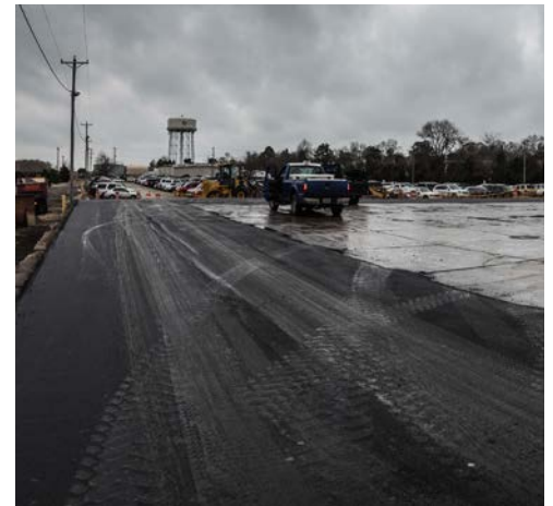
Crews are working to add 500 spaces at the Hidens parking lot. The project is expected to be complete by the end of March.