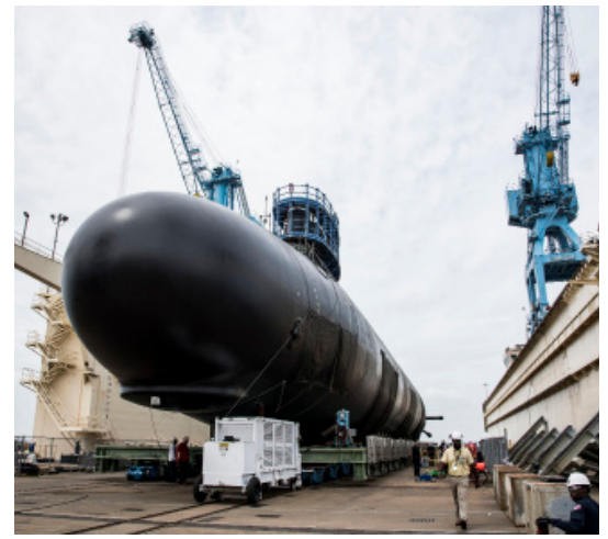
SSN 789 was successfully launched into the James River and moved to Newport News Shipbuilding's submarine pier for final outfitting, testing and crew certification.