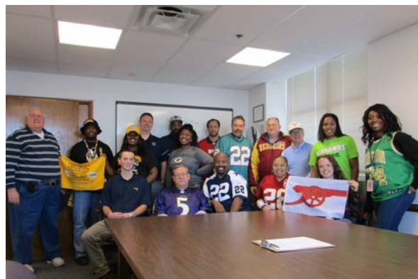
Shipbuilders celebrate "Team Tuesday."

Five teams of shipbuilders competed for the title of most spirited.