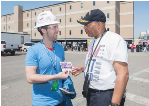
Shipbuilders spread the word about Relay For Life during lunch.