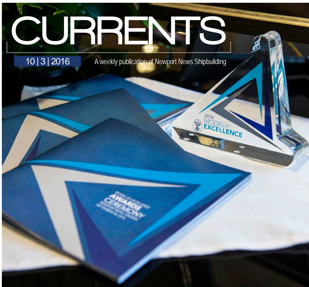
The 2016 Model of Excellence Award is displayed during the awards ceremony on Sept. 28.

A weekly publication of Newport News Shipbuilding