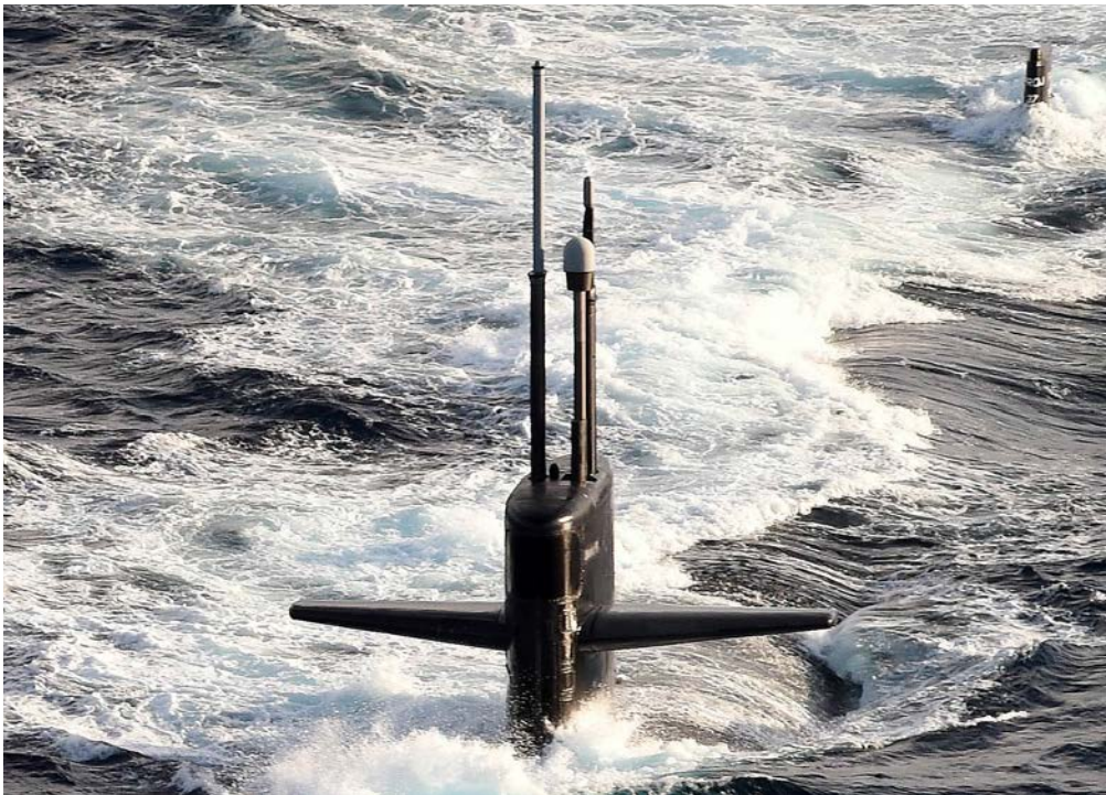
The submarine USS Helena (SSN 725) transits the Atlantic Ocean in March.