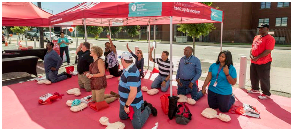
Shipbuilders participate in hands-only CPR training during the American Heart Association’s Mobile Bus Tour held outside of Bldg. 520 at Newport News Shipbuilding on Sept. 23.

Newport News Shipbuilding is a sponsor of the 2016 American Heart Association’s Heart Walk. The events will be held on Oct. 22 at the Peninsula Town Center in Hampton and Oct. 29 at Mount Trashmore in Virginia Beach. Visit www.hamptonroadsheartwalk.org to register as an NNS team lead or to join an existing team as a walker.