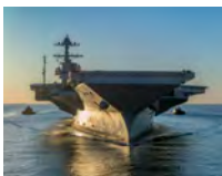
Cover Photo: Gerald R. Ford (CVN 78) departs for builder's sea trials.