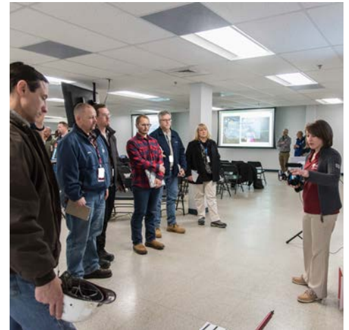
Shipbuilders watch a demonstration at the Metrology and Technology Expo.