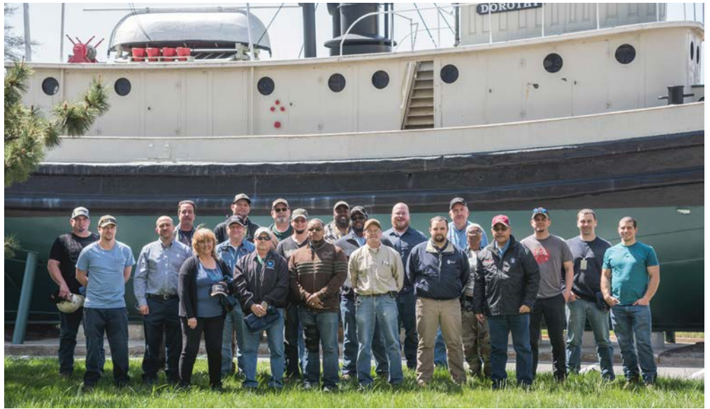
"Top Gun" welders were recognized during a luncheon Friday, April 6.