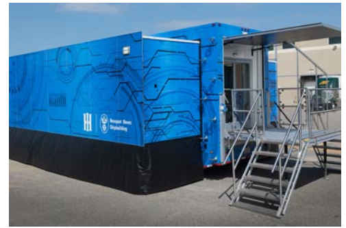
Craftsmen, craftswomen and their families will have an opportunity to tour NNS' mobile experience (MX) trailer at the Trades iDS Open House.